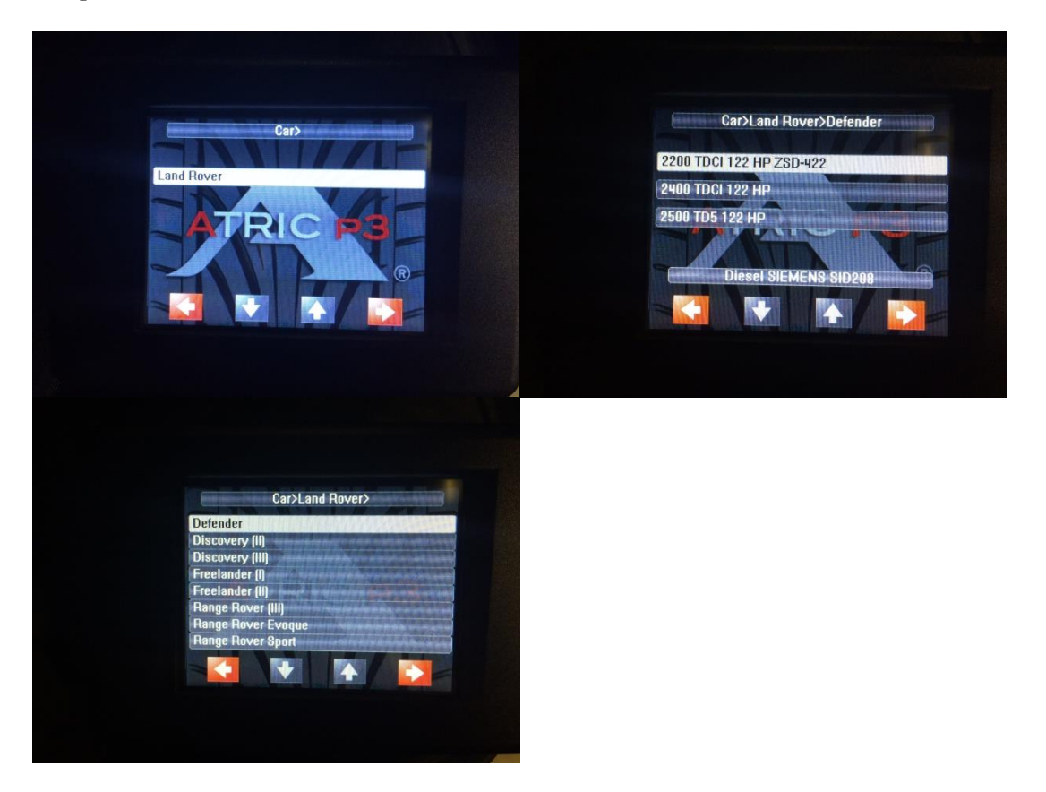
Step 4 - Follow on screen instructions