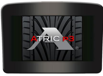
Atric P3 User Guide. (Demonstrated on a 2.2Tdci)

Step 1 - Plug the device into the OBD port on your vehicle.